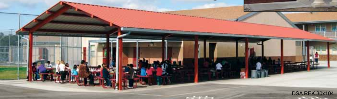
DSA REK 30x104

Standard or Custom Poligon shelters can easily be adapted to your existing school site. All shelter sizes are available in 1' increments and offer options such as ornamentation, railings, column covers and cupolas. However, if you need a shelter with special size or shape requirements, our knowledgeable team will work with you from concept to completion. Choose Poligon to create a one of a kind structure perfect for your site.