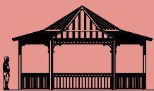
Ornamentation and railings shown are optional.